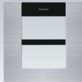
Plate for Dimmer (This plate can be used with Socket Outlets/Accessory)